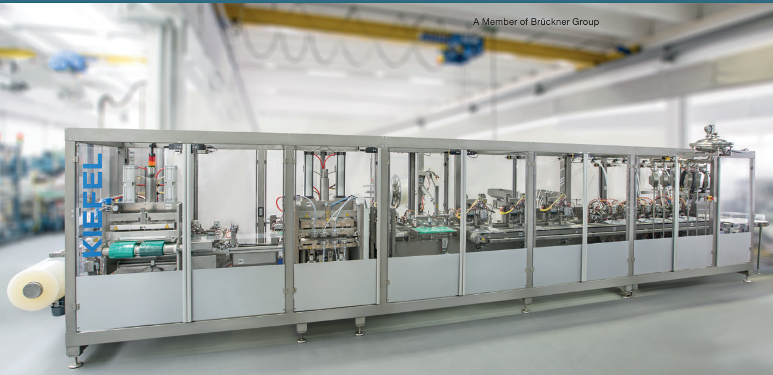
Example: Form-Fill-Seal machine KIF 53 Highliner