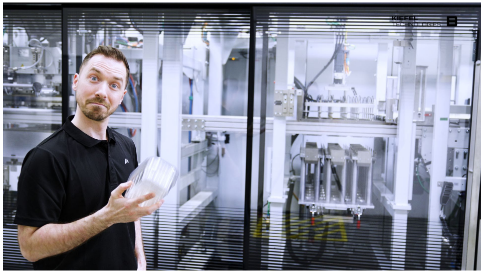
Fast availability of cutting-edge polymer packaging machines to instantly grow production capacity.