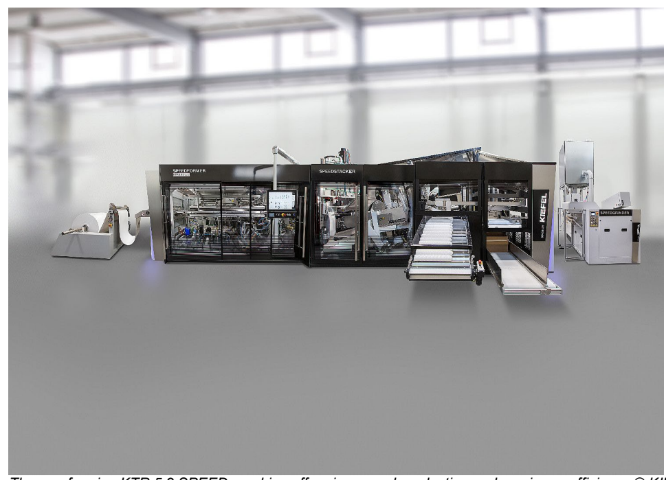
The cup-forming KTR 5.2 SPEED machine offers increased production and maximum efficiency.