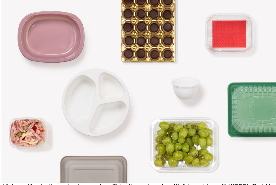
High-quality plastic packaging can be efficiently produced on Kiefel machines.