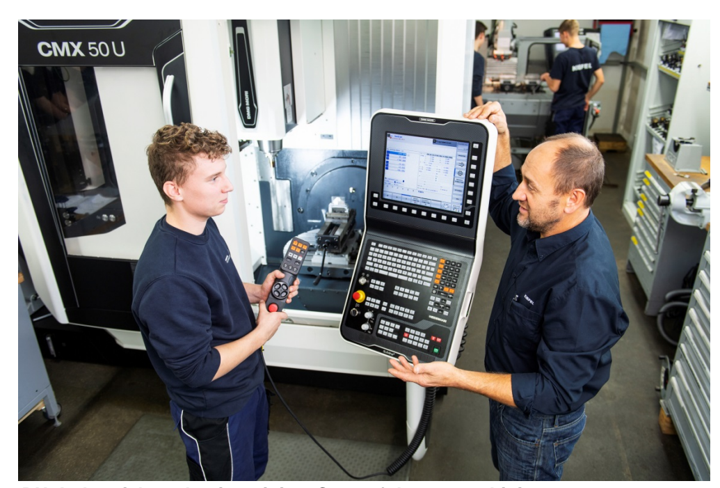
BU: Industrial mechanic training. State of the art machining centers are available