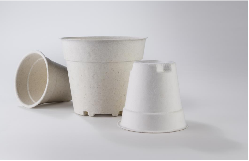
Product diversity of fiber formed products