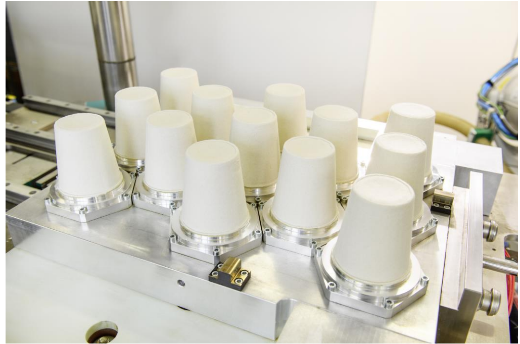
Pre formed products at hot press station